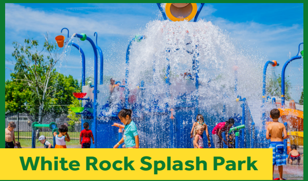
White Rock Splash Park