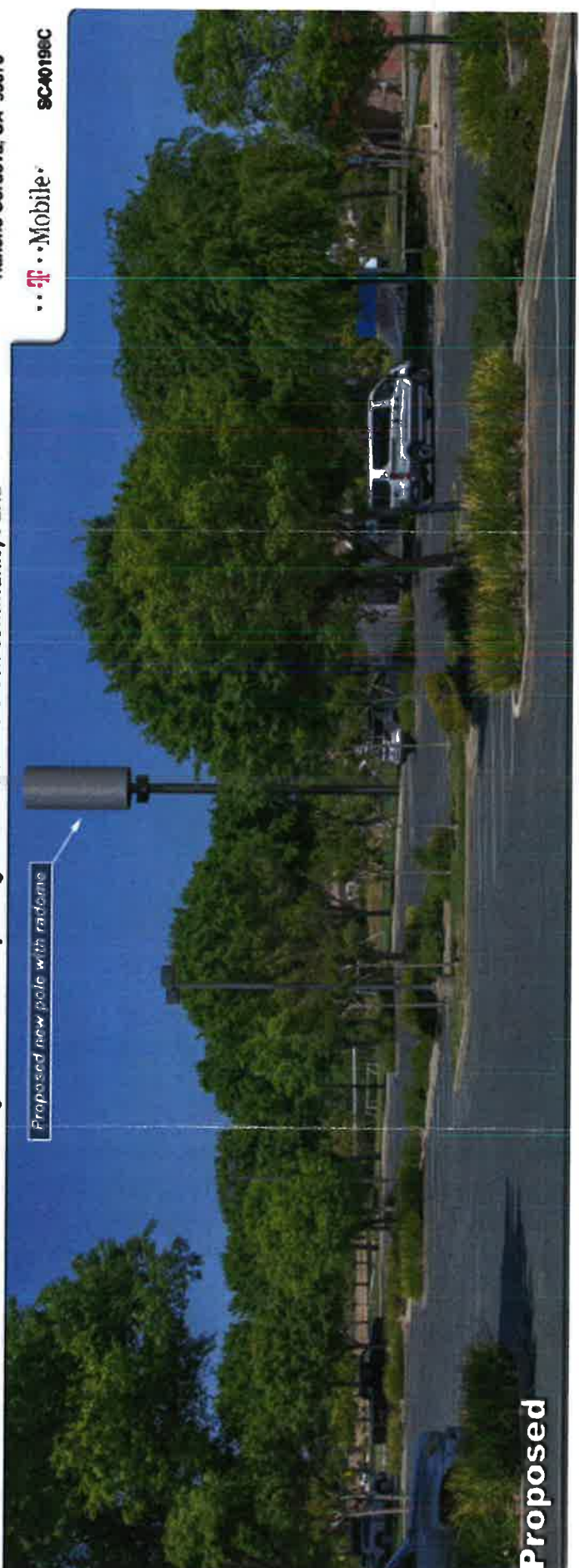
Photosimulation of the view looking north from the parking lot to the Stone Creek Community Park.

Stone Creek Park 3625 Spoto Drive Rancho Cordova, CA 95670 5F Mobile SC4019EC